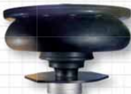
Air Spring Assembly